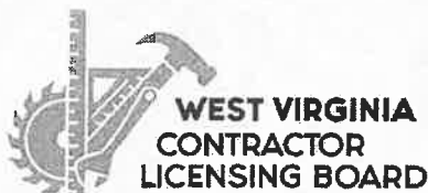
Chair, West Virginia Contractor Licensing Board

A copy of this license must be readily available for inspection by the Board on every job site where contracting work is being performed. This license number must appear in all advertisements, on all bid submissions, and on all fully executed and binding contracts. This license is non-transferable. This license is being issued under the provisions of West Virginia Code, Chapter 30, Article 42.