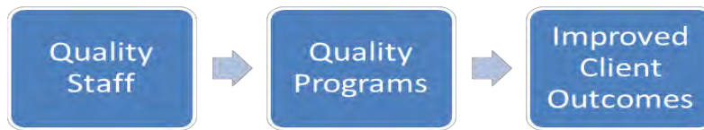
Figure 4. Quality Improvement Model

Therefore, it is critical that training specific to offender populations occurs and continues on an ongoing basis and that training efforts and service delivery are closely monitored for quality. As mentioned in the recommendation, in order to report on the effectiveness of the JRA and understand cost savings, it will be necessary to capture consistent measurements program-wide that include, but are not limited to: